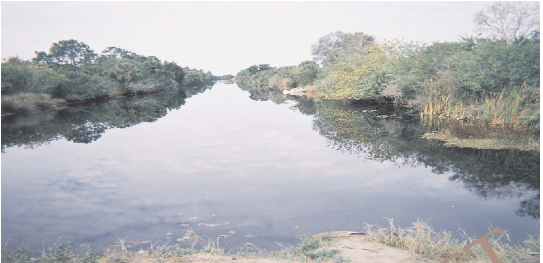
Canal View West to the St. Johns River Corridor