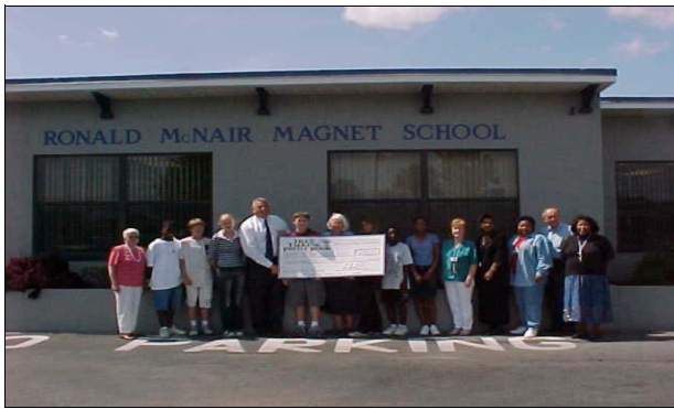
McNair Magnet School 2002 Middle School Winners

The Brevard County Solid Waste Management Department, in partnership with the League of Women Voters of the Space Coast and The Talking Phone Book challenged school children throughout Brevard County to collect phone books for recycling. The students, teachers, and parents met the challenge! The Talking Phone Book Company generously donated $3,300.00 for cash prizes in a contest between all Brevard County Public Schools. The contest was divided into three categories; elementary school, middle school, and high school. The award was based on the number of phone books collected compared to the number of students at each school.