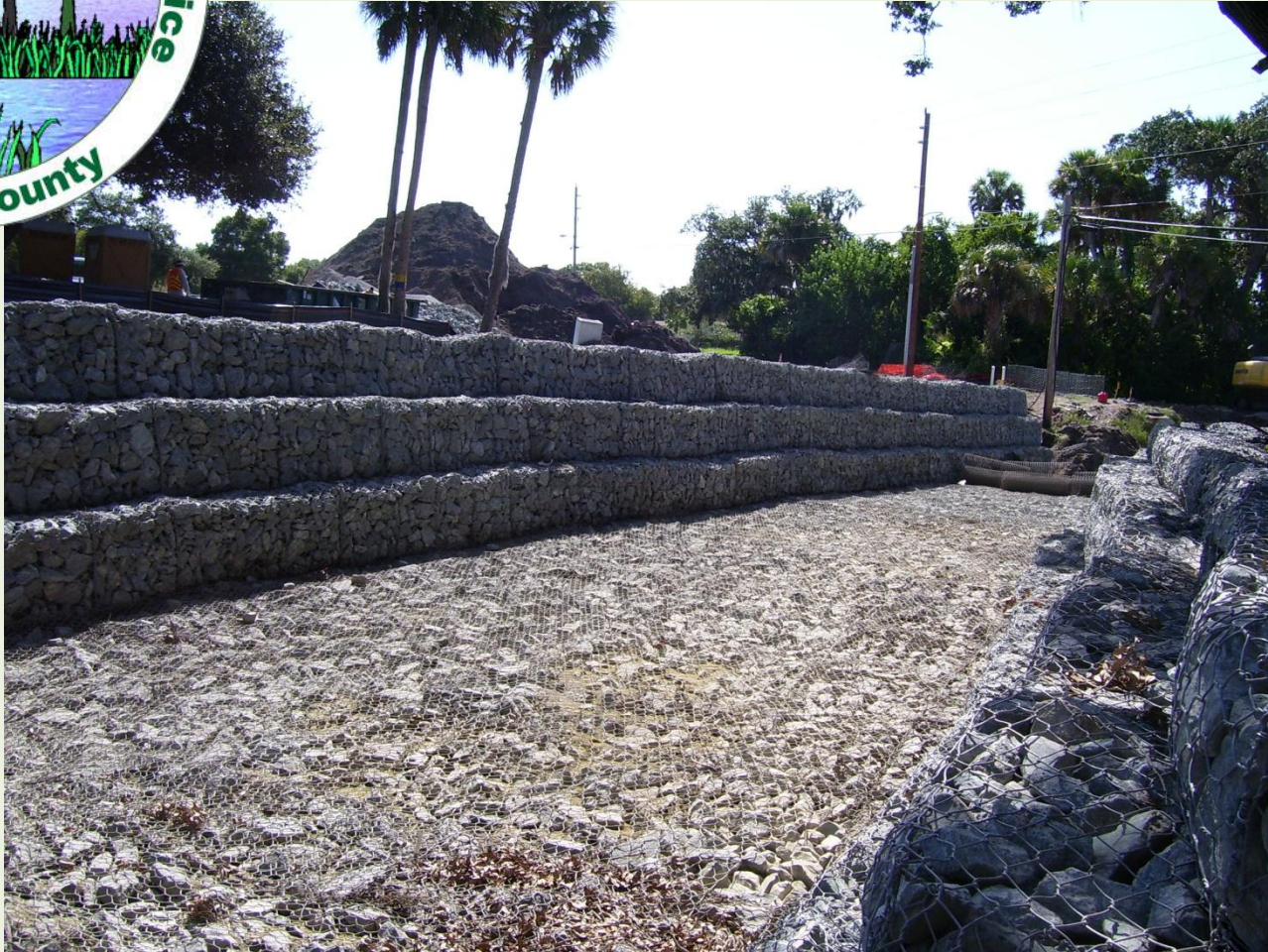
Picture of the M-1 canal construction progress August, 2010